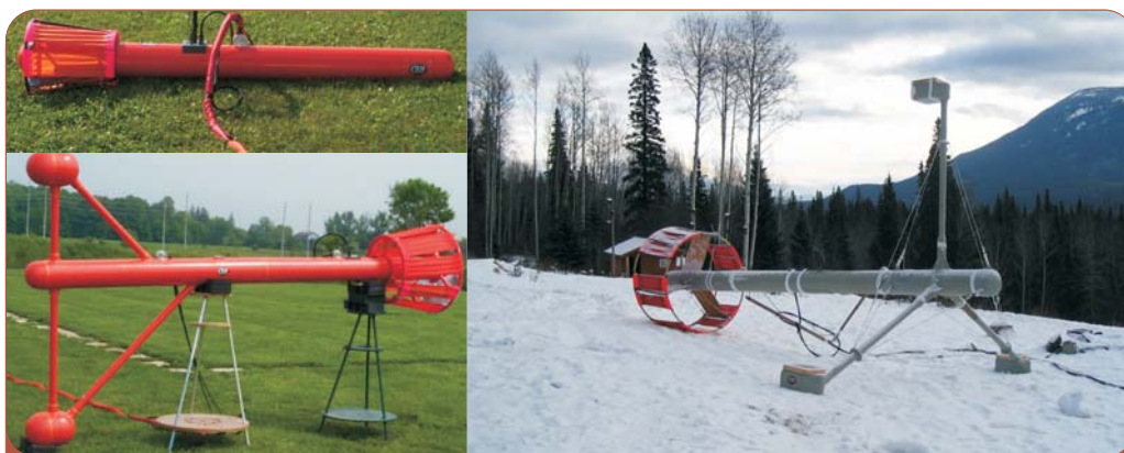
Magnetometer, Vertical / Horizontal and Tri-Axial Gradiometers offerings based on the latest GSMP-35A high resolution sensor.

All of these technologies come complete with two year warranty.