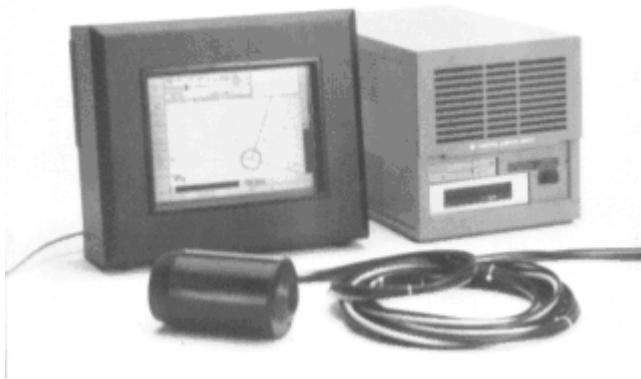
GSMP-30 High Sensitivity Potassium Magnetometer Sensor with AirNAV Data Acquisition and Navigation System