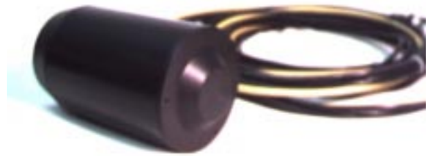
GSMP-30 High Sensitivity Potassium Sensor