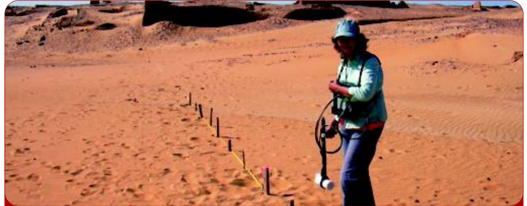
The GSM-19GW magnetometer / gradiometer offers very high sensitivity plus fast sampling rate for walking unit as shown.

Picket and line marking / annotation for capturing related surveying information on-the-go