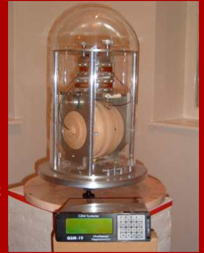
Precision Suspended Coil dIdD VECTOR Magnetometer

GEM Magnetometers for Earth Observation include; 1. high Precision suspended coil VECTOR Magnetometer for precise evaluation of the x, y, z components of the field and monitoring precise changes in the Declination and Inclination and 2. robust continuous reading Euromag SCALAR total field magnetometer for calibration.