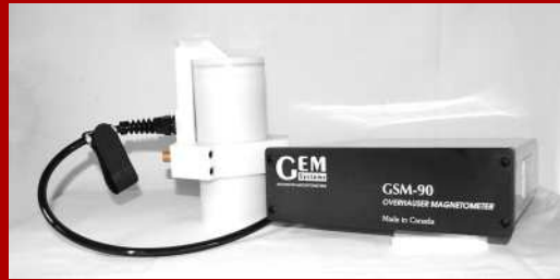
Robust Overhauser continuous reading Total Field Magnetometer

Our Leadership and Success in the World of Magnetics is Your key to success in applications from Archeology, Volcanology and UXO detection to Exploration and Magnetic Observation Globally.