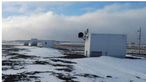
Canadian Observatories use the GSM-90 as secondary standard for the earth's magnetic field. Sanikiluaq (SNK) Magnetic Observatory, Quebec Canada

The EUROMAG is deployed in many installations globally, notably in observatories and on Mt. Etna, where dedicated scientists from the Instituto Nazionale di Geofisica e Vulcanologia (INGV) are using the system as a cornerstone of their research into the periodic eruptions of Europe's active volcano.