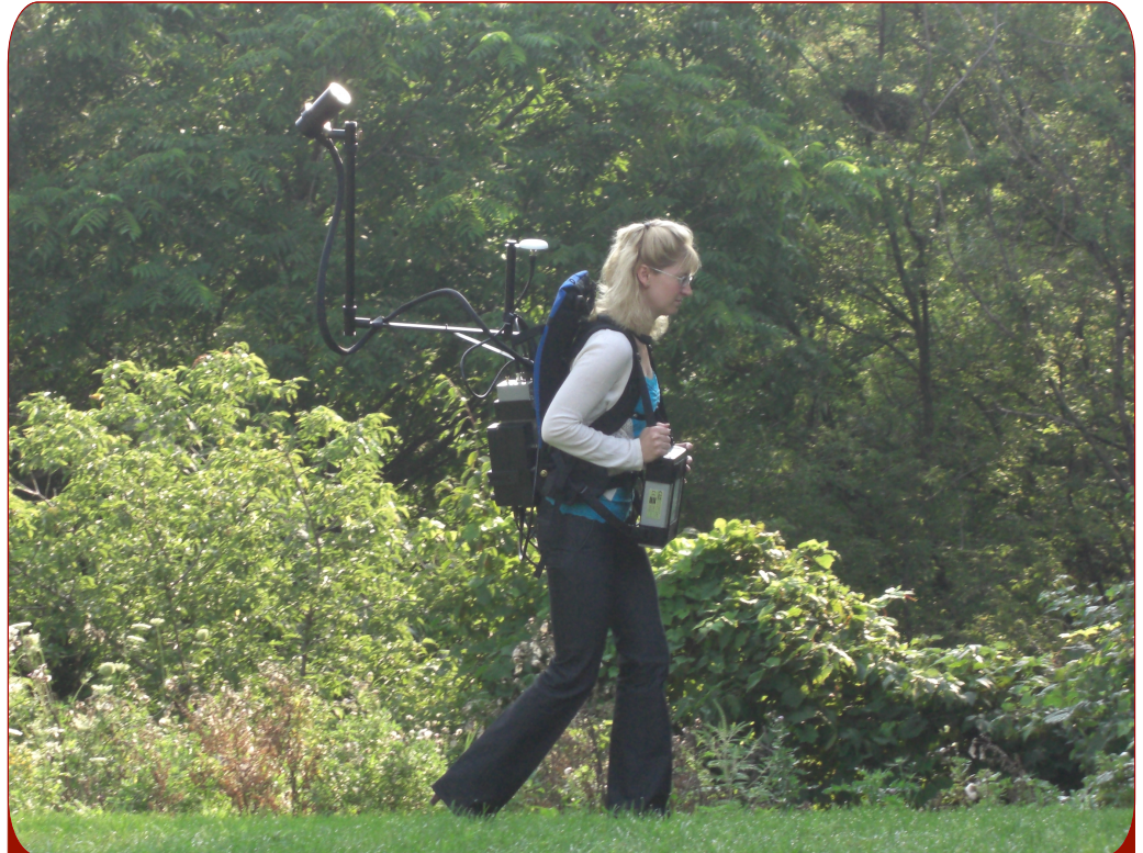
Optically Pumped Potassium (GSMP-40) ground system with backpack, electronics, light weight sensors and cable.

And all of these technologies come complete with the most attractive savings and warranty in the business!