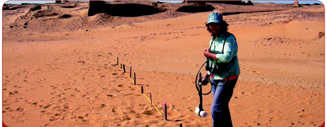
The GSM-19GW magnetometer / gradiometer offers very high sensitivity plus fast sampling rate for walking unit as shown.

And all of these technologies come complete with the most attractive savings and warranty in the business!