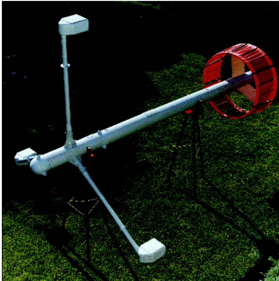
Photo of GEM 4-Sensor Helicopter System. 4 Potassium sensors are arranged in an imaginary tetrahedron for measurement of total field and three gradients.

The noise envelope is 6 pT/m for 20 readings per second. Signal processing algorithms also provide a measure of noise (fourth difference) for all channels, direct gradients between any pair of sensors.